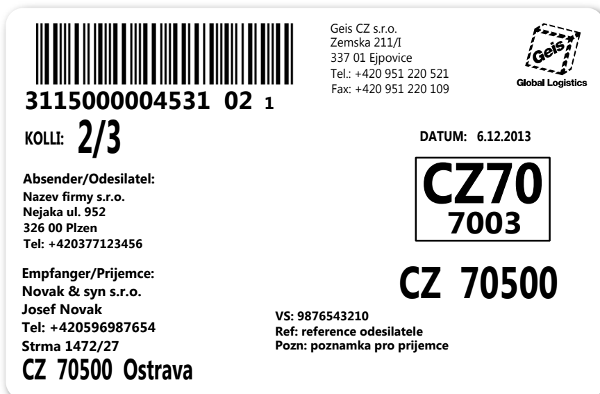
Figure 5: Previews of labels – shipment with three pieces.