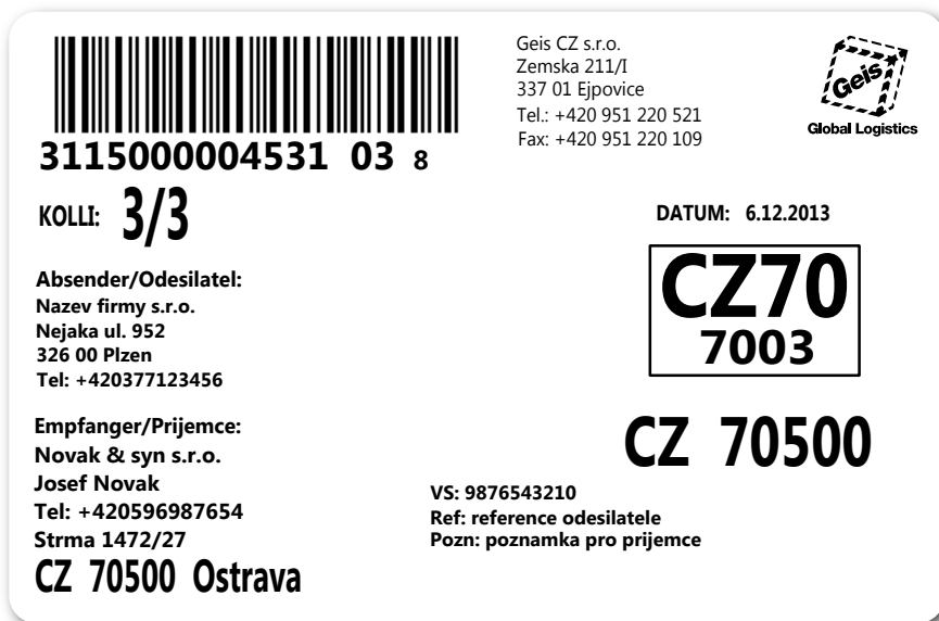
Figure 6: Previews of labels – shipment with three pieces.