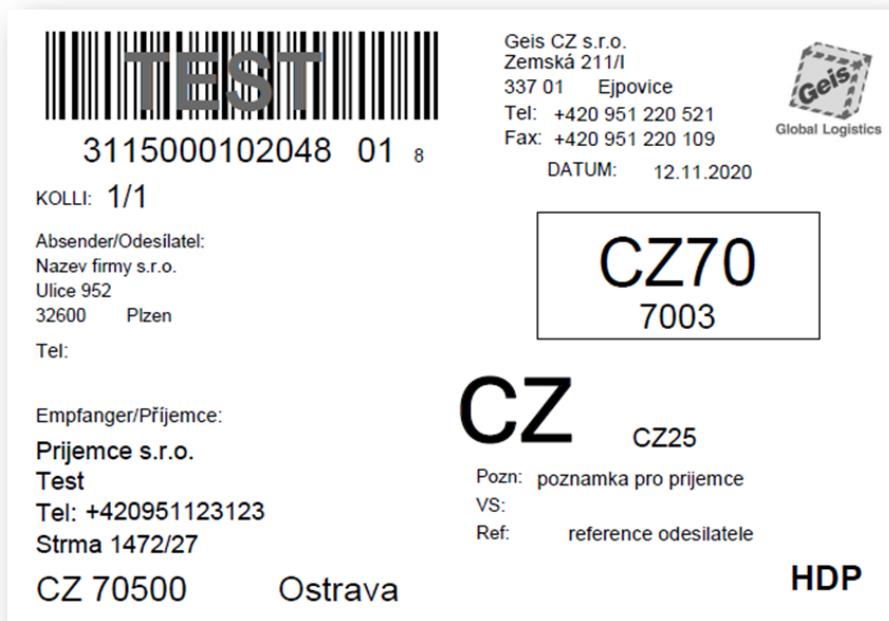
Figure 7: Preview of label with service HDP (eventual HDS).