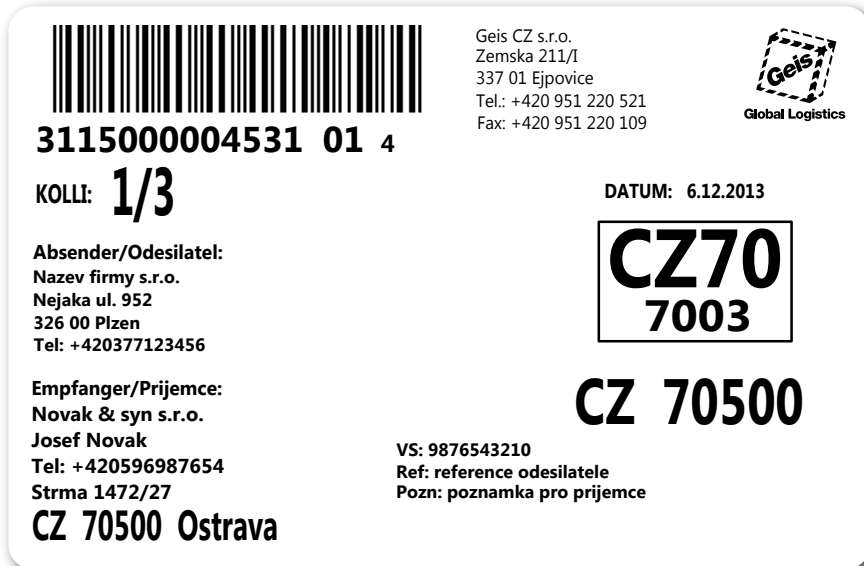
Figure 4: Previews of labels – shipment with three pieces.