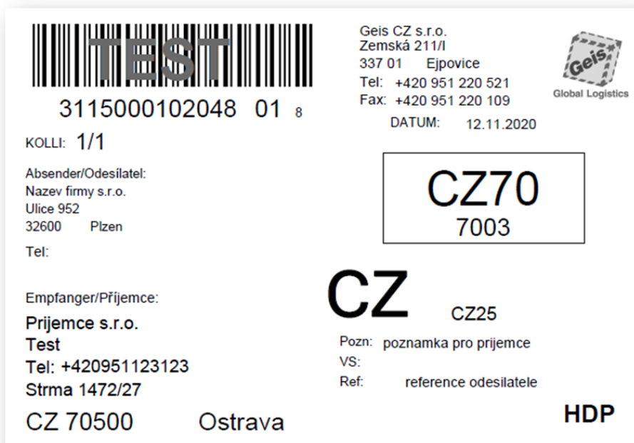
Figure 7: Preview of label with service HDP (eventual HDS).